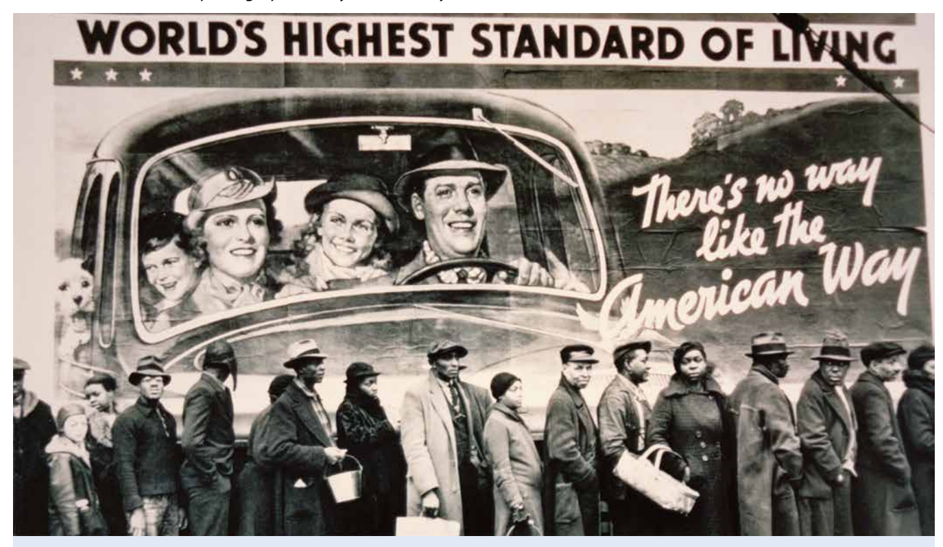
This photograph titled, "World's Highest Standard of Living," was taken by photographer Margaret Bourke-White and was featured in Life magazine's February 1937 issue.

Directions: Observe the photograph closely and record your observations.