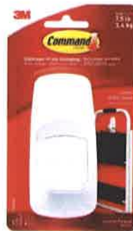
Command Jumbo Decorative Hook White Shop all Command