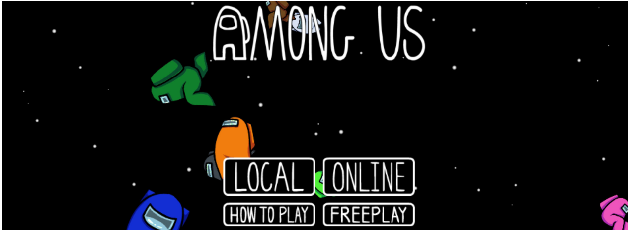
Left: A screenshot from the game Among Us