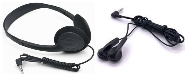
Flimsy and tend to break super quickly