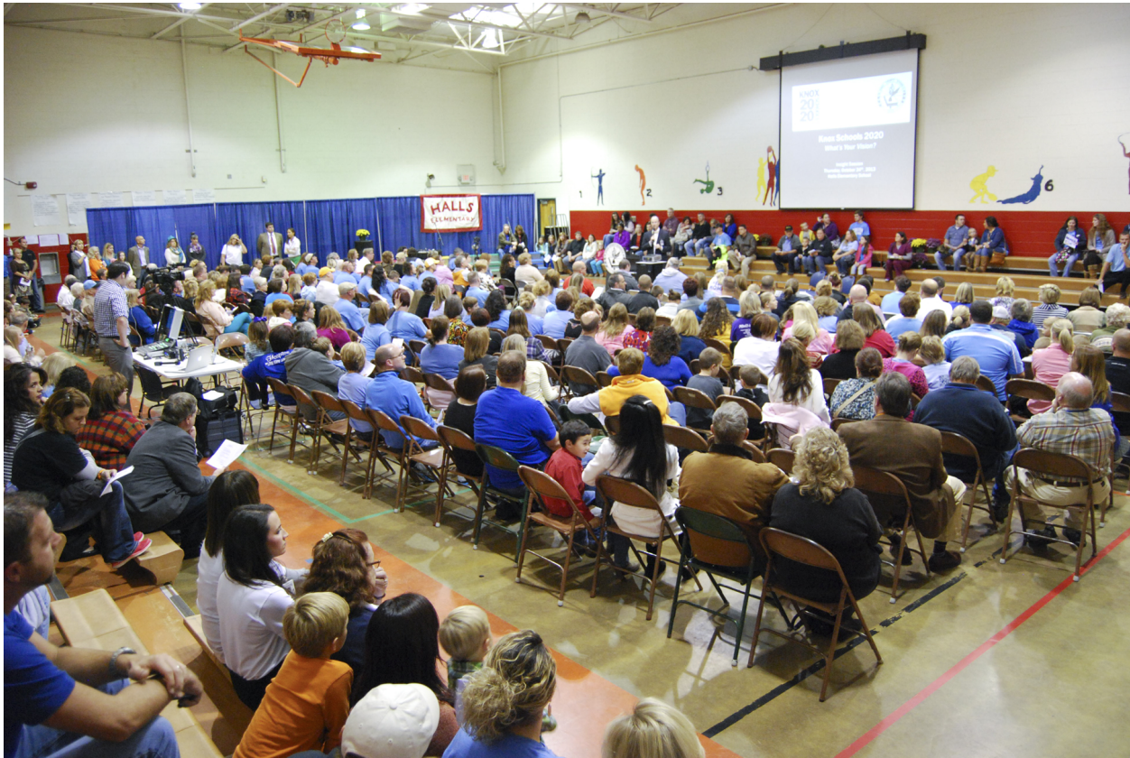
Community members attend a strategic plan public forum at Halls Elementary School in October.