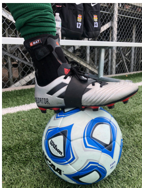
This is the game ball from the Lady Hornets' first win against Cocke County at their first home scrimmage.