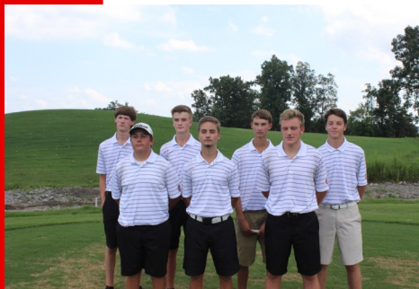
2014 CHS Golf Team